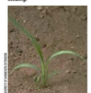
ID: Seedling—long hair at base of leaf only