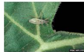
Damsel Bug (Adult)