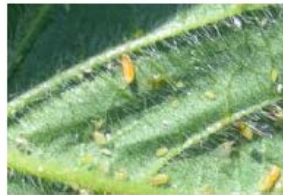
Aphid Midge Larvae