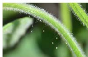
Green Lacewing (Eggs)