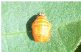
Lady Beetle Pupa