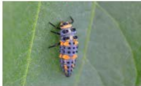
Lady Beetle Larva