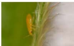
Minute Pirate Bug (Nymph)