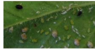
Aphids parasitized by: Aphelinidae (top, black mummies) and Braconidae (lower, tan mummies) wasps.