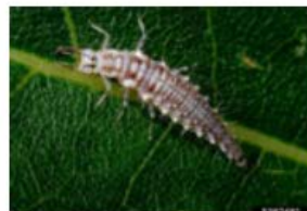
Lacewing Larvae (Aphid lion)