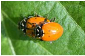
Convergent Lady Beetle Adults