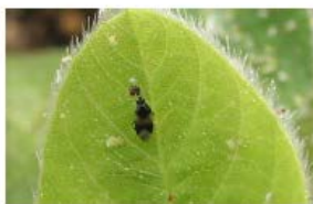
Minute Pirate Bug (Adult)