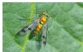
Long Legged Fly