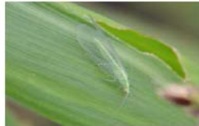
Green Lacewing (Adult)