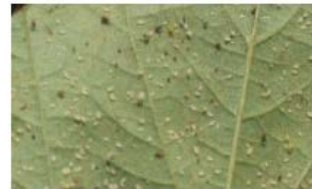
The fuzzy, off-colored aphids were killed by a fungal parasite.