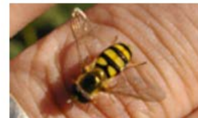
Syrphid (Hover Fly) Adult